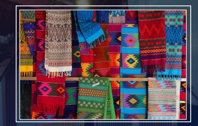
Textiles & Garments