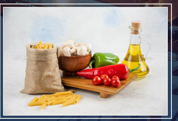
Agriculture & Food Products